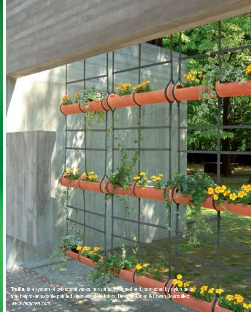
Treille , is a system of cylindrical vases, horizontally aligned and connected by nylon belts and height-adjustable painted stainless steel tutors. Design: Ronan & Erwan Bouroullec www.teracrea.com