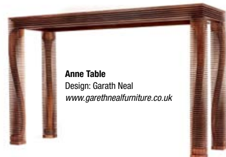
Anne Table Design: Garath Neal www.garethnealfurniture.co.uk