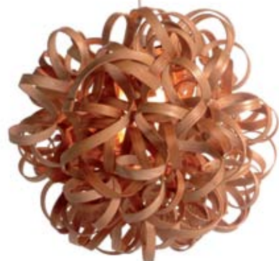
Giant CurlyShade , 60 metres of Cornish Ash secured around a frame by hand. Design: Sixixis www.sixixis.com