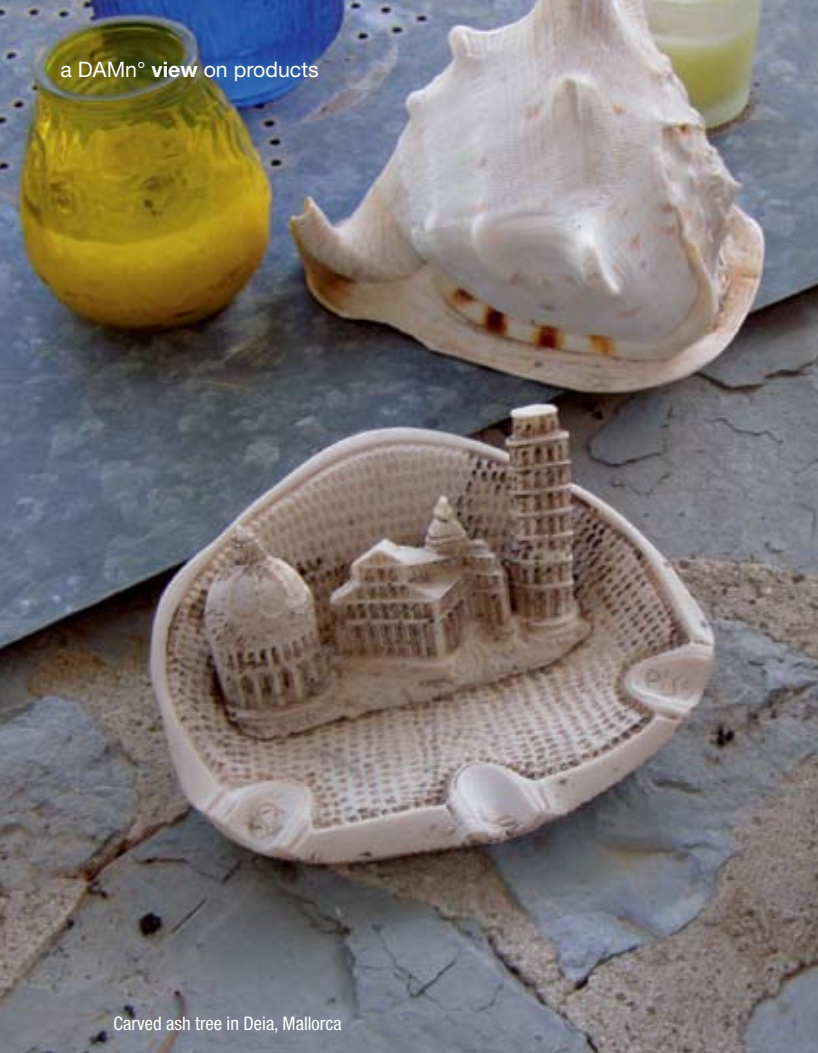
Carved ash tree in Deia, Mallorca