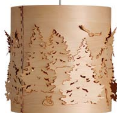
Norwegian Forest , these lights draw on a classic Scandinavian tradition of using thin birch strips for lighting. Design: Cathrine Kullberg www.cathrinekullberg.com